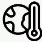
Temperature Standardization and Control Policy and Procedure