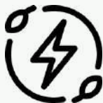
Electricity, Water, and LPG Conservation Policy