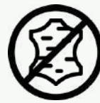
No Fur Policy